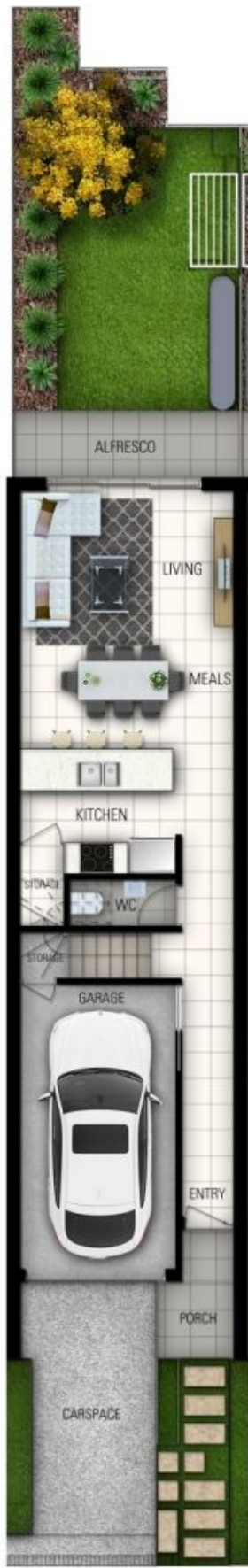
Plans shown are only indicative of layout. Dimensions are approximate.