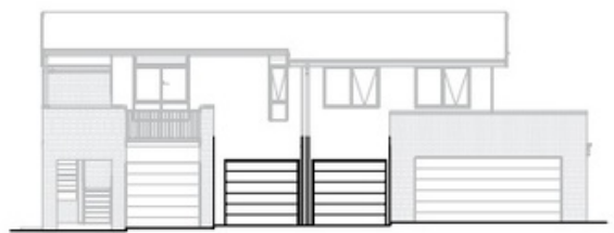
1214 GARAGE ELEVATION