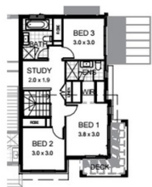
1214 FIRST FLOOR PLAN